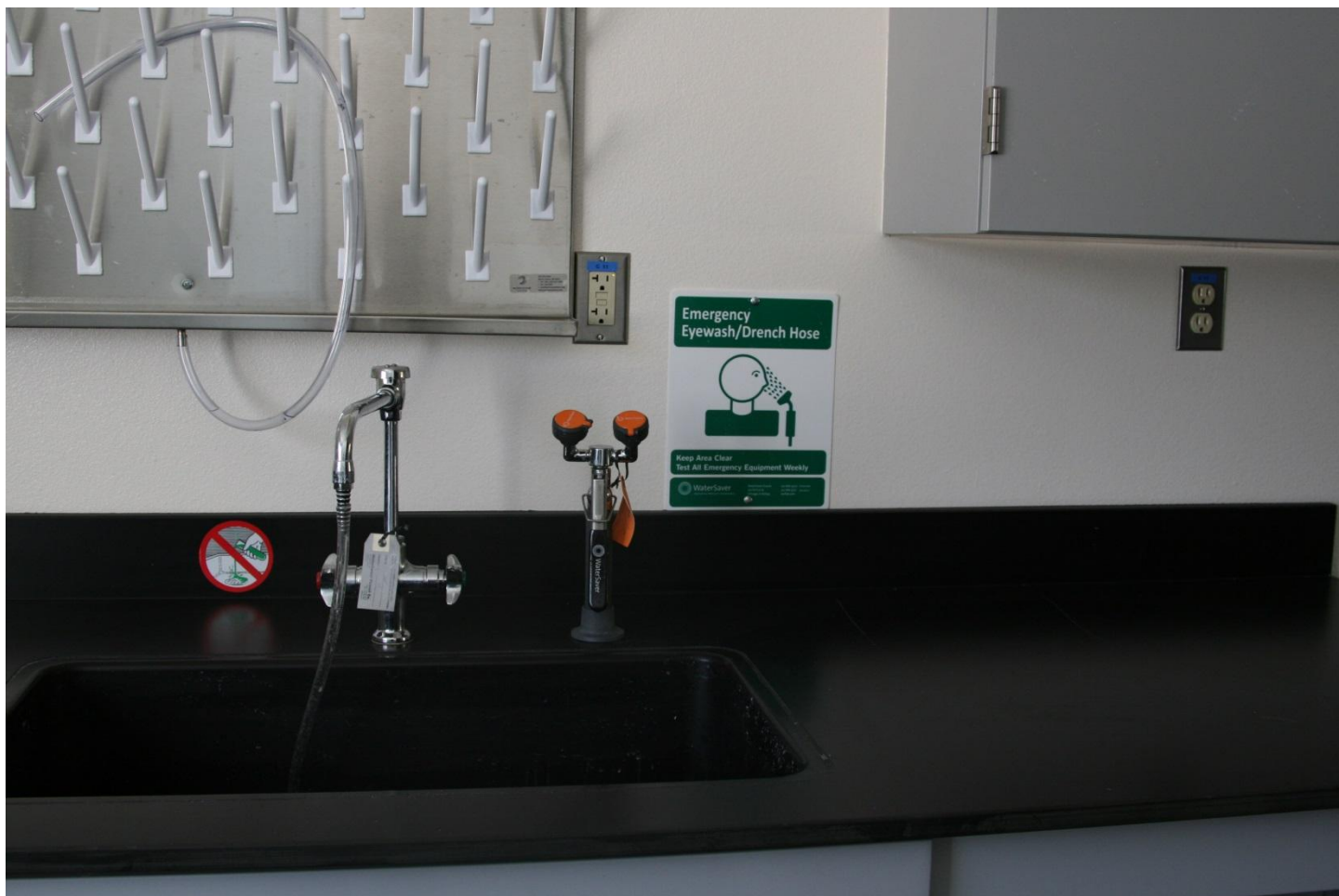
Figure 2: Emergency eye wash station in Lab 1101.

Some labs are assigned long-term to our resident research staff. These are currently labs 1003 and 1010. Others are held back for our short-term users. Users are permitted to request a particular lab space but in order to maximize lab use final assignment is at the discretion of the Director.