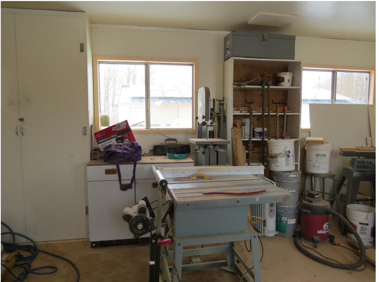
Figure 6: Wood Shop equipment