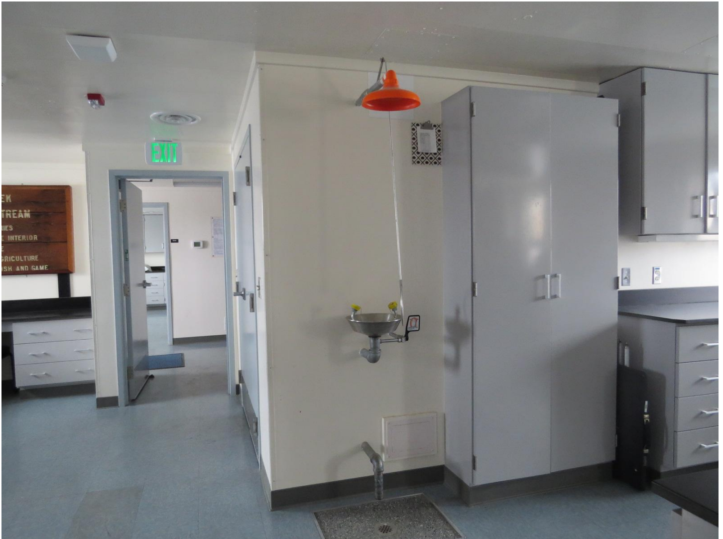
Figure 1: Emergency eye wash and shower located in lab 2002.

The emergency eye wash and shower are located in lab 2002 between 2002a and 2002d (Figure 1). An additional eye wash is located in room 1101 (Figure 2). The common area lab (1005) contains most of the shared equipment including the water system, fume hood and waste storage.