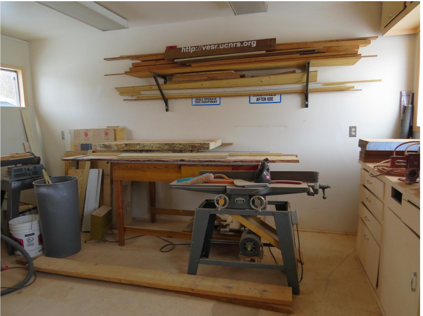
Figure 7: Wood shop equipment