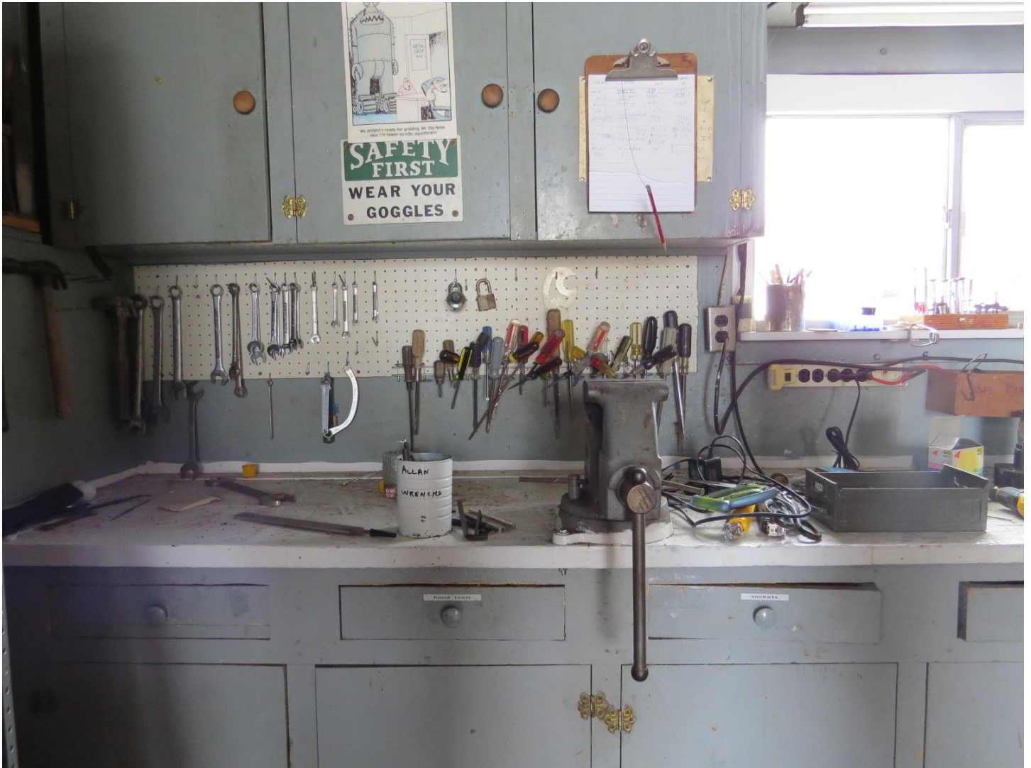
Figure 4: Tool bench in the shop. Please check with the Steward before borrowing any tools. No tools may be taken off site without prior permission. Tools must be signed out, returned in good shape and signed back in.

Various tools are available - Anyone wishing to use them must contact the Steward, Brent Salzman or Cabot Thomas for orientation and clearance. Safety training must be completed and documentation signed before use of any power tools in the shop.