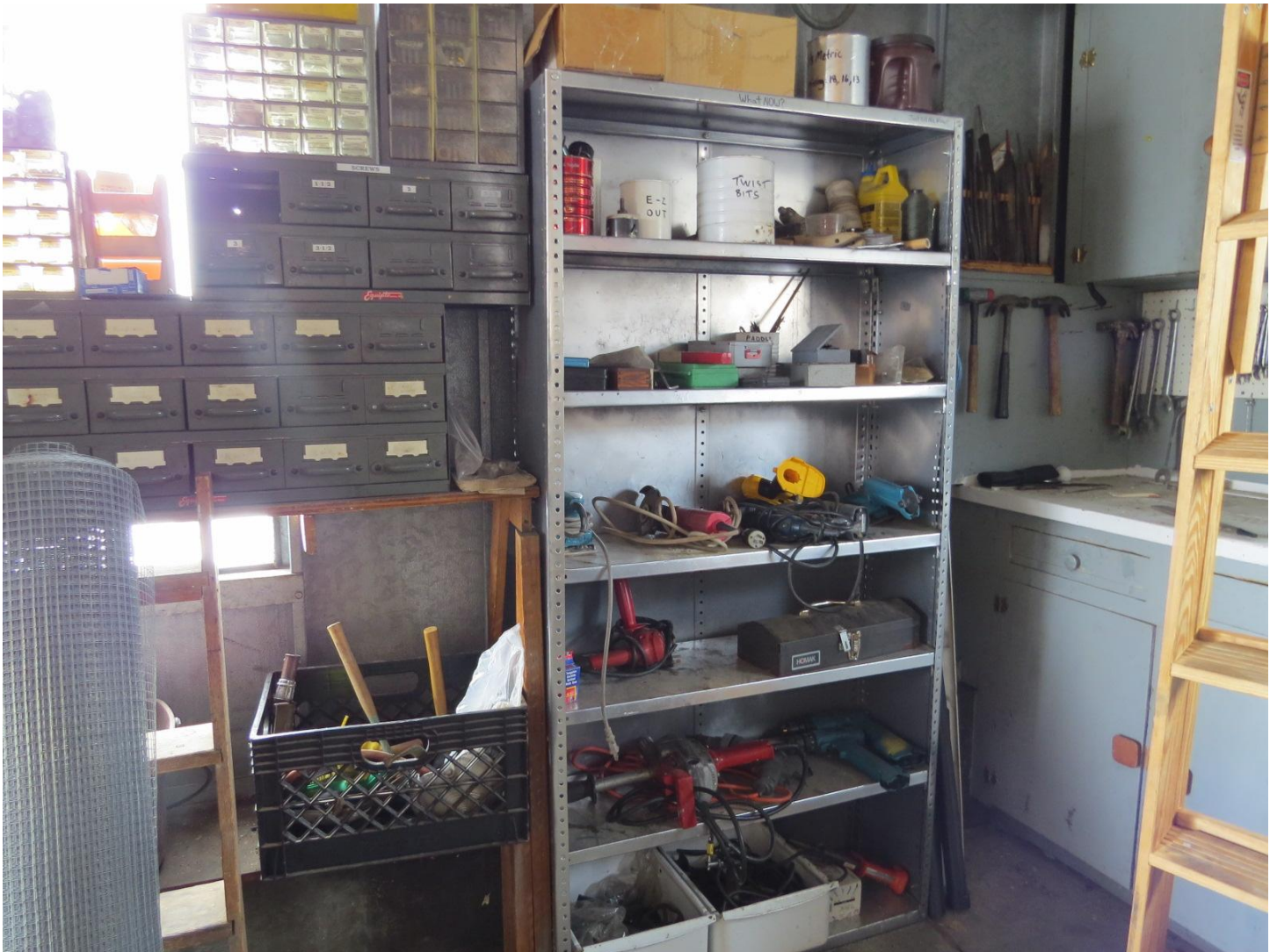
Figure 5: Power tools are available but you must complete the required safety checks first. Power tools must be signed in and out, cannot be taken from the property and must be returned in working condition.